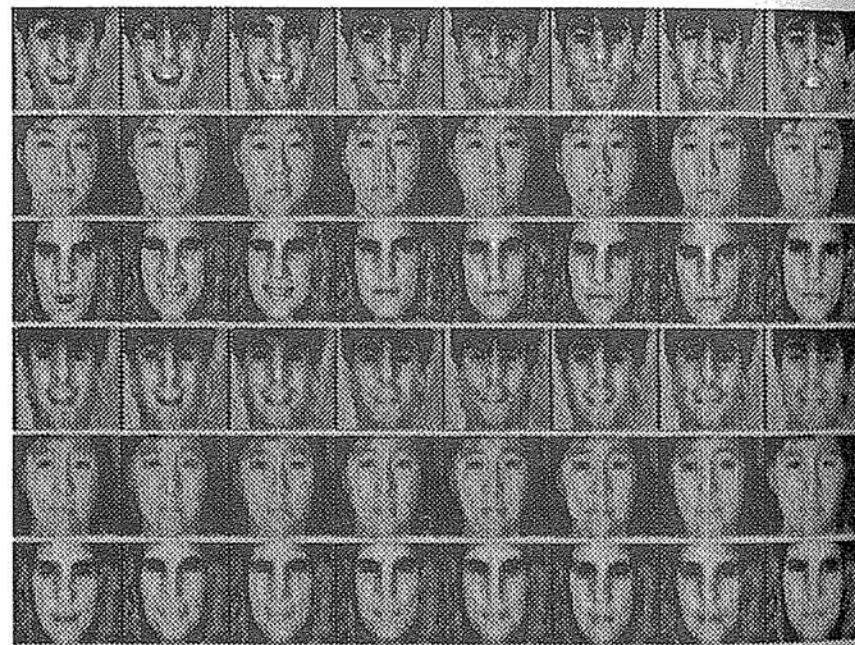
Figure 2: Three subjects and their reproductions by the compression network.

The whole image is input at once to our network, so the input layer is 64 \times 64 . We used 40 hidden units, and a 64 \times 64 output layer, with a sigmoidal activation function with range [-1, 1] . Due to the extreme difference in fan-in at the hidden and output layers (4096 vs. 40), differential learning rates were used at the two layers. Use of a single learning rate led to most of the hidden units becoming pinned at full off or on regardless