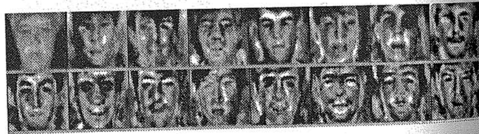
Figure 4: Sixteen holons derived by PCA from hidden unit responses.

We investigated the representation formed by the compression network. We found the receptive fields of the hidden units in this network to be white noise. In order to extract the actual features used, we recorded the hidden unit activations as the network processed all 160 images. We formed the covariance matrix of the hidden unit activations, and extracted the principal components. Note that this operation "re-localizes" the principal components from the distributed representation used. The resulting vectors may be decompressed for viewing purposes. The results are shown in Figure 4.