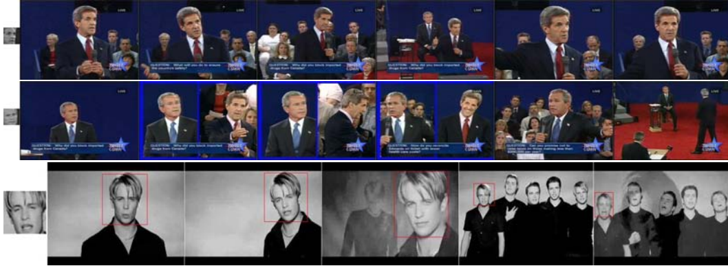
Figure 3: Keyframes of a few shots detected with annotation

Table 3 reports results from tagging experiments for five albums. No. of people identified reports the number clusters having more than one faces, as singleton cluster will always be correct for that person. Thus, people appearing only once in the entire album are not reported, which reduce the no. of identified people. % identified and % false +ve are averaged over all clusters detected in the album, and are calculated for each cluster as: \% \text{ identified} = \frac{\text{No. of correct faces in the cluster}}{\text{Total no. of faces of the person}} and \% \text{ false +ve} = \frac{\text{false +ves in the cluster}}{\text{Total no. of faces in the cluster}} . It can be seen that the kernel performs reasonably well on the dataset. Figure 2 shows a representative cluster with the first 8 images as true +ves and rest as false +ves.