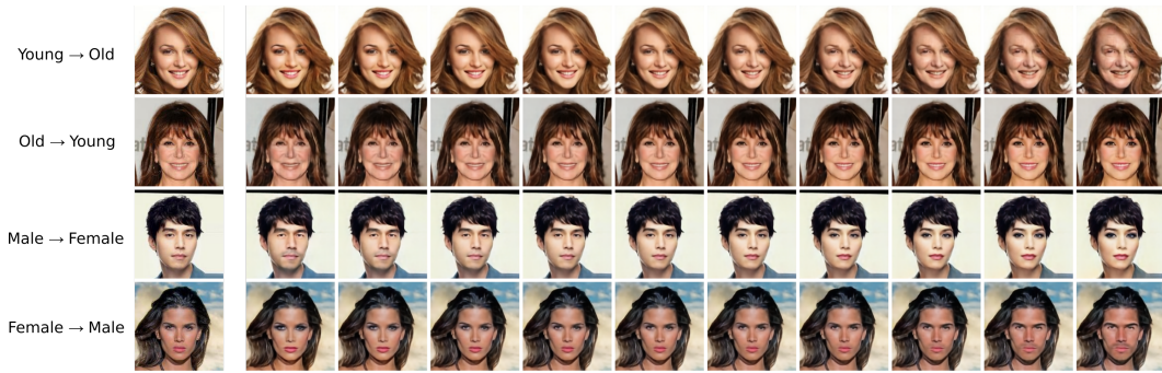
Figure 1: Interpolation between different attributes (Zoom in for better resolution). Each line shows reconstructions of the same face with different attribute values, where each attribute is controlled as a continuous variable. It is then possible to make an old person look older or younger, a man look more manly or to imagine his female version. Left images are the originals.

The fundamental feature of our approach is to constrain the latent space to be invariant to the attributes of interest. Concretely, it means that the distribution over images of the latent representations should be identical for all possible attribute values. This invariance is obtained by using a procedure similar to domain-adversarial training (see e.g., [21, 6, 15]). In this process, a classifier learns to predict the attributes y given the latent representation z during training while the encoder-decoder is trained based on two objectives at the same time. The first objective is the reconstruction error of the decoder, i.e., the latent representation z must contain enough information to allow for the reconstruction of the input. The second objective consists in fooling the attribute classifier, i.e., the latent representation must prevent it from predicting the correct attribute values. In this model, achieving invariance is a means to filter out, or hide, the properties of the image that are related to the attributes of interest. A single latent representation thus corresponds to different images that share a common structure but with different attribute values. The reconstruction objective then forces the decoder to use the attribute values to choose, from the latent representation, the intended image.