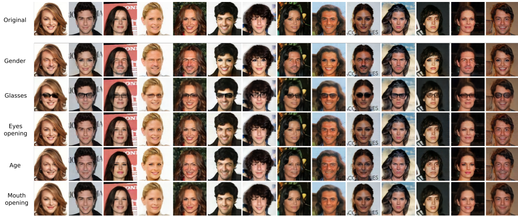
Figure 3: Swapping the attributes of different faces. Zoom in for better resolution.

Qualitative evaluation Figure 3 shows examples of images generated when swapping different attributes: the generated images have a high visual quality and clearly handle the attribute value changes, for example by adding realistic glasses to the different faces. These generated images confirm that the latent representation learned by Fader Networks is both invariant to the attribute values, but also captures the information needed to generate any version of a face, for any attribute value. Indeed, when looking at the shape of the generated glasses, different glasses shapes and colors have been integrated into the original face depending on the face: our model is not only adding “generic” glasses to all faces, but generates plausible glasses depending on the input.