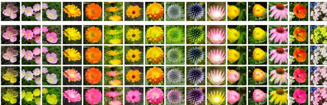
Figure 5: Examples of reconstructed flowers with different values of the pink attribute. First row images are the originals. Increasing the value of that attribute will turn flower colors into pink, while decreasing it in images with originally pink flowers will make them turn yellow or orange.

We performed additional experiments on the Oxford-102 dataset, which contains about 9,000 images of flowers classified into 102 categories [17]. Since the dataset does not contain other labels than the flower categories, we built a list of color attributes from the flower captions provided by [19]. Each flower is provided with 10 different captions. For a given color, we gave a flower the associated color attribute, if that color appears in at least 5 out of the 10 different captions. Although being naive, this approach was enough to create accurate labels. We resized images to 64 \times 64 . Figure 5 represents reconstructed flowers with different values of the “pink” attribute. We can observe that the color of the flower changes in the desired direction, while keeping the background cleanly unchanged.