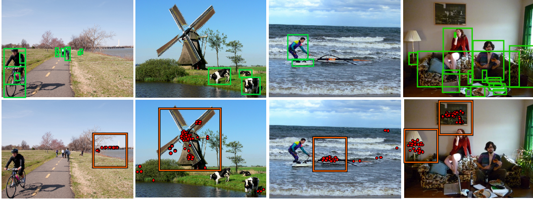
Figure 2: SNIPER negative chip selection. First row: the image and the ground-truth boxes. Bottom row: negative proposals not covered in positive chips (represented by red circles located at the center of each proposal for the clarity) and the generated negative chips based on the proposals (represented by orange rectangles).

In this way, every ground-truth box is covered at the appropriate scale. Since the crop-size is much smaller than the resolution of the image ( i.e. more than 10x smaller for high-resolution images), SNIPER does not process most of the background at high-resolutions. This leads to significant savings in computation and memory requirement while processing high-resolution images. We illustrate this with an example shown in Figure 1. The left side of the figure shows the image with the ground-truth boxes represented by green bounding boxes. Other colored rectangles on the left side of the figure show the chips generated by SNIPER in the original image resolution which cover all objects. These chips are illustrated on the right side of the figure with the same border color. Green and red bounding boxes represent the valid and invalid ground-truth objects corresponding to the scale of the chip. As can be seen, in this example, SNIPER efficiently processes all ground-truth objects in an appropriate scale by forming 4 low-resolution chips.