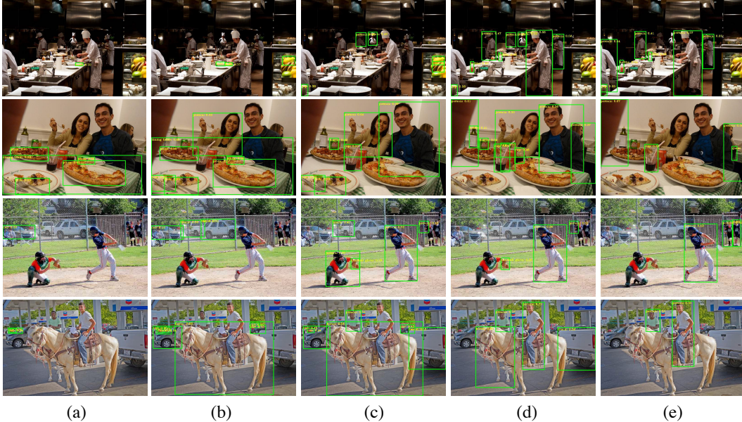
Figure 2: Detection results at a variety of customized anchor boxes. From (a) to (e) the anchor box sizes (scale, ratio) are: (2^0, 1/3) , (2^0, 1/2) , (2^0, 1) , (2^0, 2) and (2^0, 3) respectively. Note that for each picture we aggregate the predictions of all the 5 levels of detection heads, so the differences of boxes mainly lie in aspect ratios.