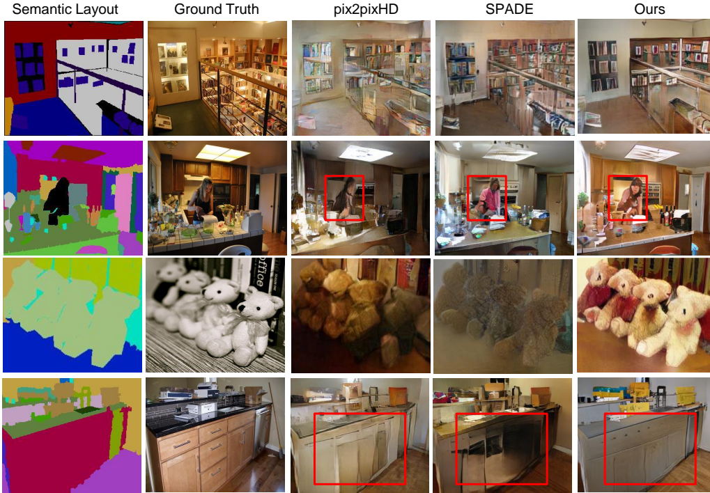
Figure 3: Results comparison with previous approaches. Better viewed in color. Zoom in for details.