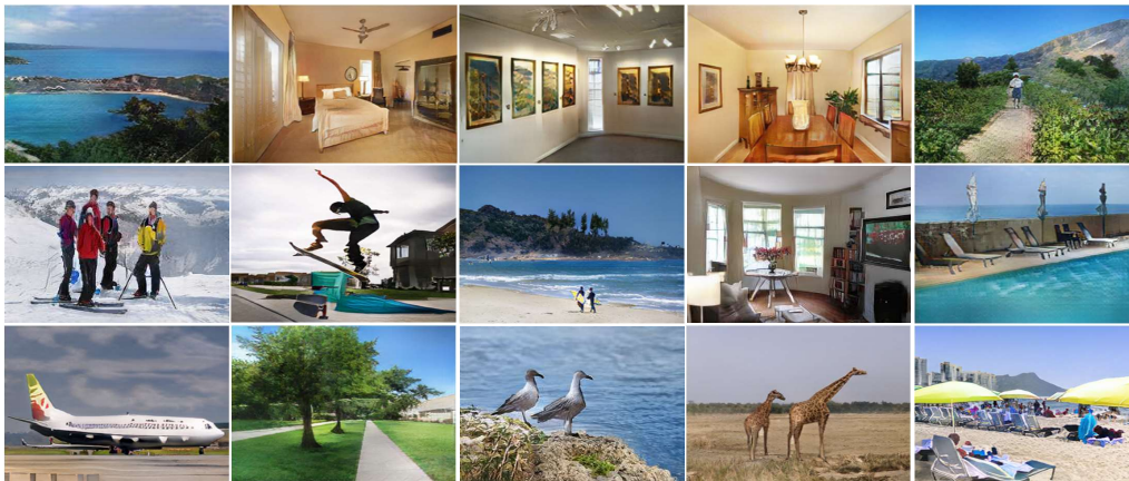
Figure 4: Semantic image synthesis results on COCO and ADE20K. Better viewed in color.

SIMS has better FID scores than GAN-based approaches, because it generates images by refining segments retrieved from the real data. However, it has poor segmentation performance, because it might retrieve semantically mismatched patches.