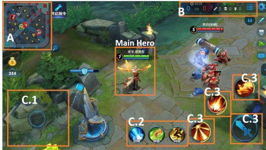
Figure 2: Game UI of Honor of Kings . The hero controlled by the player is called “main hero”. Bottom-left is the movement controller (C.1), while the right-bottom set of buttons are ability controllers (C.2, C.3). Players can observe game situations via the screen (local view), obtain game states with dashboard (B), and obtain a global view with the top-left mini map (A).

In Fig. 2, we show a game UI of Honor of Kings . All the experiments in the paper were carried out using a fixed big version (Version 1.53 series) of game core of Honor of Kings for fair comparison.