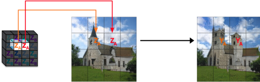
Figure 1: A diagram of Spatially Stochastic Networks. We decompose the latent code z spatially into independent blocks, and regularize the model so that local changes in z correspond to localized changes in the image. We then resample parts in the image by resampling their corresponding z 's.