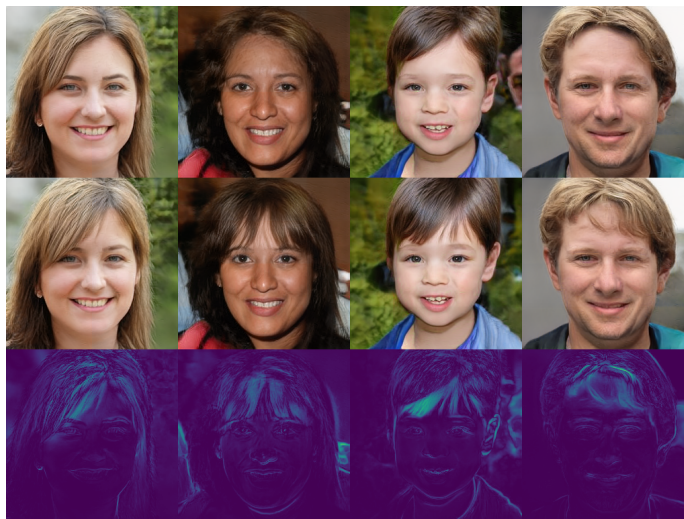
Figure 2: Resampling a person's hair. The top row consists of unmodified generations of our models, Spatially Stochastic Networks (SSNs), trained on FFHQ [17]. With SSNs, resampling two z 's near the top of each person's head makes spatially localized changes (middle row) while also allowing for minimal necessary changes in other parts of the image (third row), unlike in traditional inpainting.

resampling z' \sim P(z) and obtaining \hat{y}' = g(z', x) . There is no in-between, which is not optimal for many use cases.