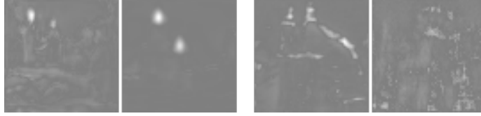
Figure 4: Left: droplet artifacts on the panel when using SPADE. Right: no droplet artifacts after introducing spatially modulated convolutions in SSNs. Images generated with the procedure of [18].

where \mathbf{s} \in \mathbb{R}^{1 \times C \times H \times W} is the conditioning and \mathbf{h} \in \mathbb{R}^{N \times C \times H \times W} is the input to the layer. Due to space constraints, we leave the full derivation of our new layer to Appendix A.