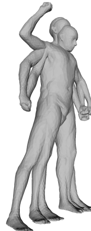
Figure 3: An example from Partial SHREC Figure 4: An example of alignment from SCAPE