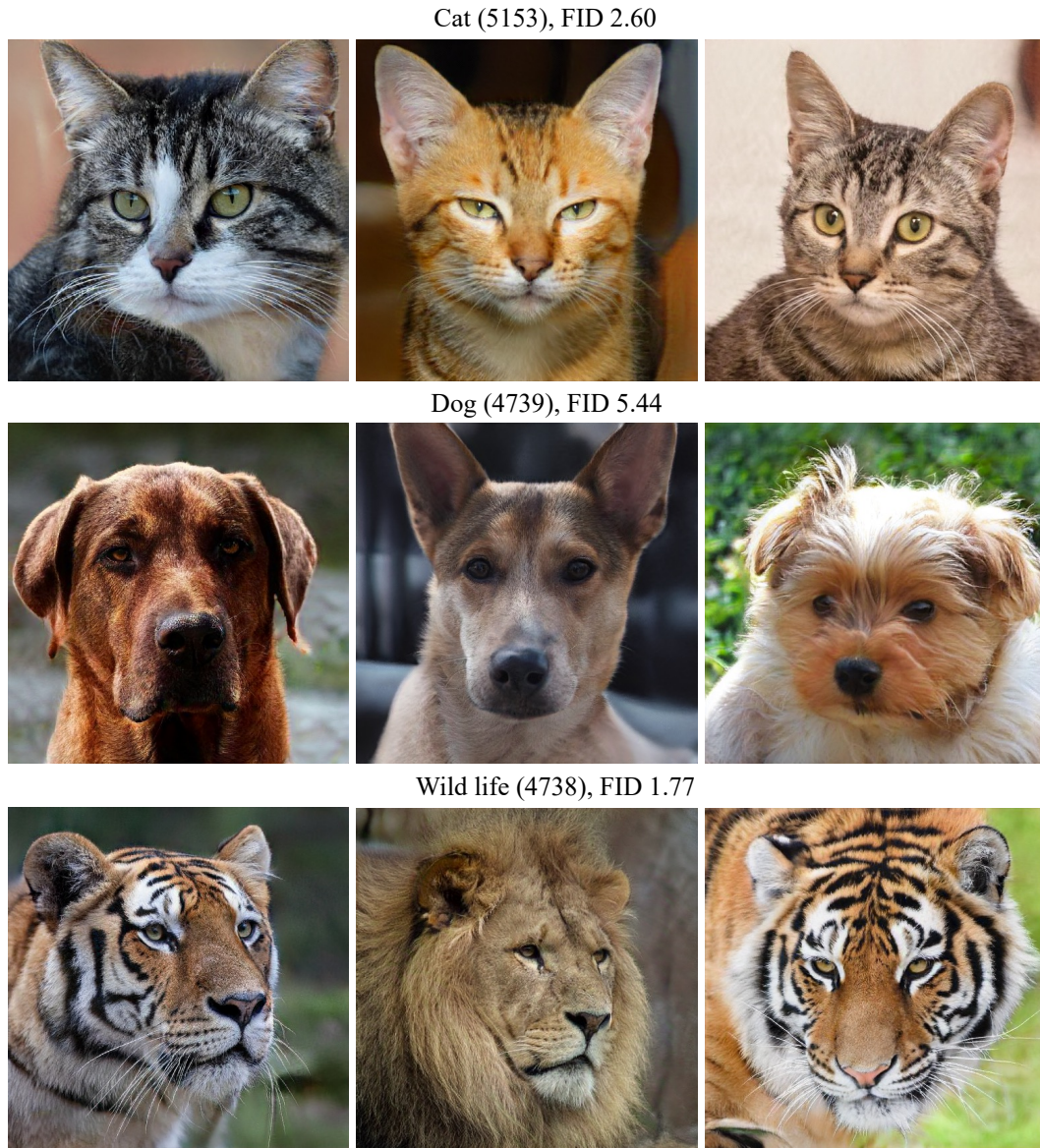
Figure A1: Synthesized samples on AFHQ. All images are generated without truncation.

We present more synthesized images of FFHQ with less training images in Fig. A3 and AFHQ in Fig. A1. Moreover, we qualitatively compare against ADA [1] in Fig. A2. Even if the number of training image becomes 2000, our approach remains to produce the photo-realistic images while the artifacts appear on ADA [1].