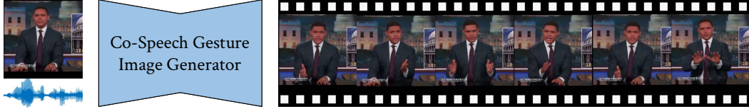
Figure 1: Illustration of Problem Setting. In this paper, we focus on audio-driven co-speech gesture video generation. Given an image with speech audio, we generate aligned speaker image sequence .

accumulation in the training phase, which makes the generated results unnatural. Besides, most previous works ignore the problem of co-speech gesture video generation. Only few works [21, 39] animate in the image domain as an independent post-processing step , which borrows from the existing pose-to-image generators [5, 13] to train on the target person’s images. How to design a unified framework to generate speaker image sequence driven by speech audio remains unsolved.